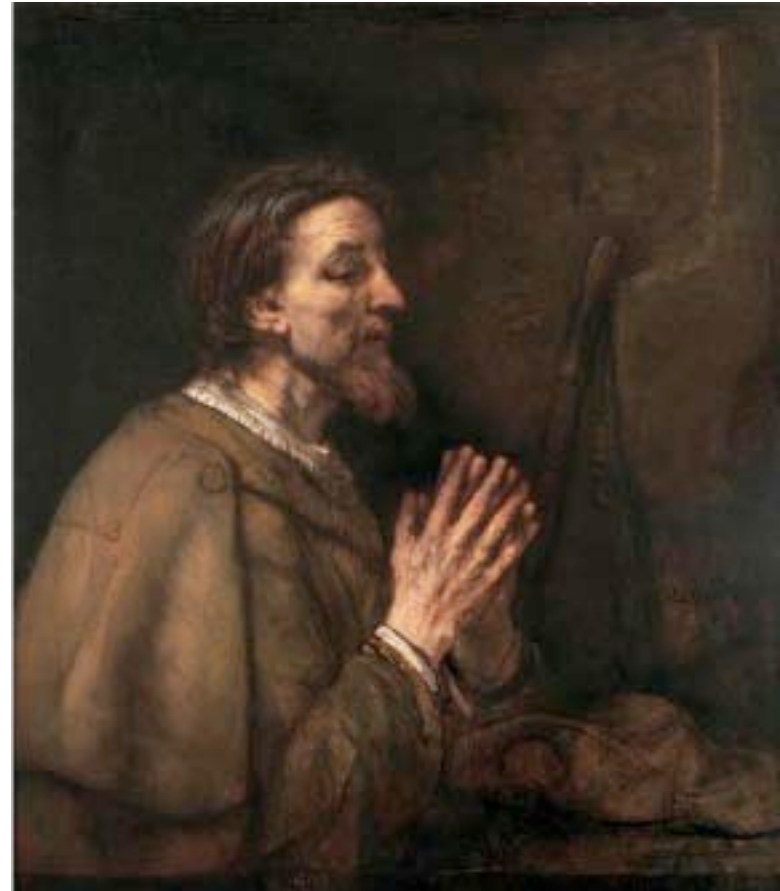
The Apostle James the Major (1661)

The ravaged, timeworn face hinting at intellectual and spiritual purity establishes this unique work as one of the world's greatest pictures (even when seen with the limitations imposed by this screen and digital format).