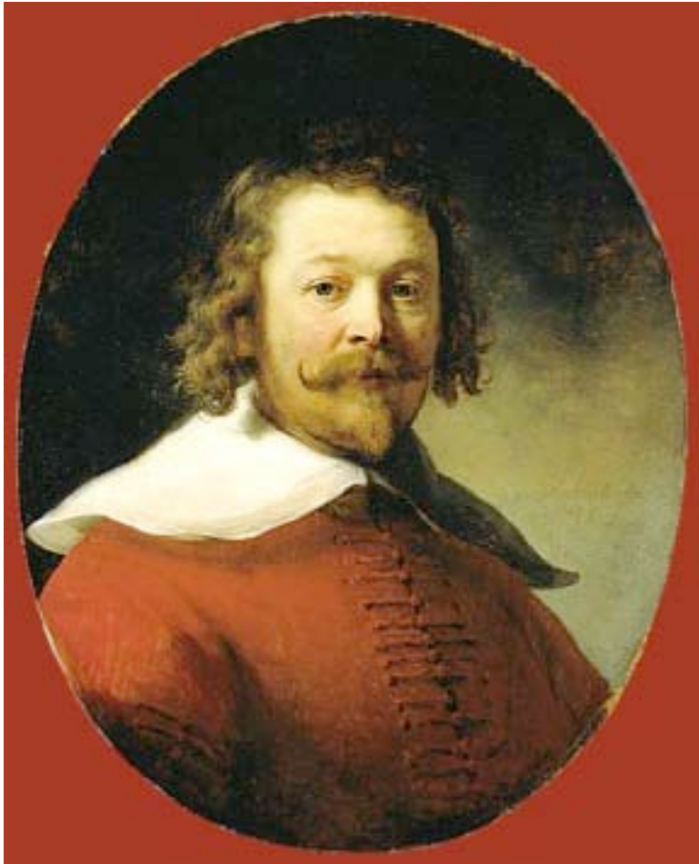
Young Man with a Red Doublet (1633)

A young face, perhaps, but one already projecting a true character through thoughtful, expressive eyes.